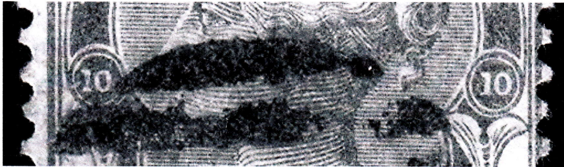
Plate number 10

PLATE 1 AND 13 WERE DEFECTIVE AND NOT REGISTERED. PLATES 2 TO 20 WERE COMPOSED OF 240 STAMPS IN 12 PANES OF 20 STAMPS, THE PANES ARRANGED IN 4 ROWS OF 3 PANES EACH. A PANE CONSIST OF 5 ROWS OF 4 STAMPS OF 3 PENNY . PLATE 3 WAS REGISTERED BUT NEVER PUT TO PRESS. PLATES 20 TO 21 (WATERMARK CROWN) WERE ARRANGED IN TWO PANES EACH OF 120 STAMPS IN 10 ROWS OF 12 STAMPS.