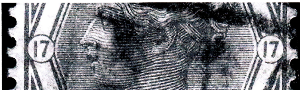
Plate number 17

PLATE 1 TO 4 WERE COMPOSED OF 240 STAMPS IN TWELVE PANES, EACH OF 20 STAMPS. THE PANES WERE ARRANGED IN FOUR ROWS OF THREE AND EACH PANE WAS ARRANGED IN 5 ROWS OF 4 STAMPS OF 6 PENNY . THE CORNER LETTERS FOLLOWED THE USUAL COURSE. PLATES 17 AND 18 (MODIFIED) WERE IN TWO PANES OF 120 STAMPS IN 10 ROWS OF 12 STAMPS. PLATES 2 AND 7 WERE NOT REGISTERED. FROM PLATE 10 ONLY FIVE COPIES HAVE BEEN RECORDED. PLATE 13 WAS NEVER PUT TO PRESS OTHER THAN IN GREY.