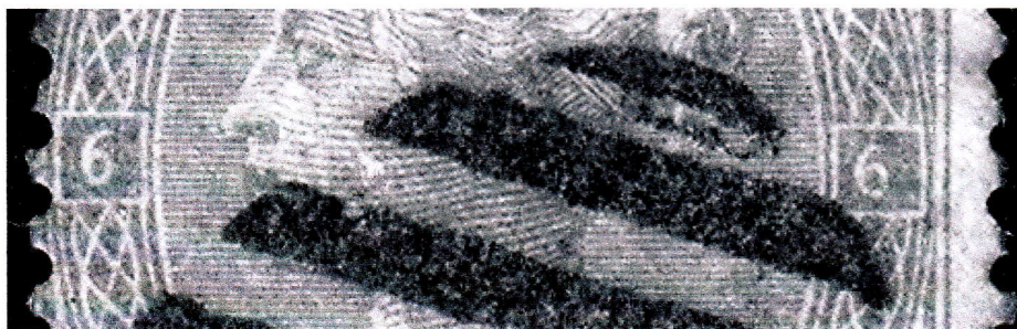
Plate number 6

PLATES 1 TO 13 (WITH WATERMARK SPRAY OF ROSE) WERE COMPOSED OF 240 STAMPS IN TWELVE PANES OF 20 STAMPS. THE PANES LYING IN FOUR ROWS OF THREE WERE IN 5 ROWS OF 4 STAMPS OF 1 SHILLING . PLATES 13 AND 14 WITH WATERMARK CROWN WERE IN TWO PANES OF 120 STAMPS IN 10 ROWS OF 12 STAMPS. STAMPS FROM PLATE 2 THOUGH EACH STAMP BEARS THE PLATE NUMBER “2”. PLATE “3 IS AN “ABNORMAL” AND WAS NEVER PUT TO PRESS.