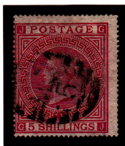
PLATE 1, 2 AND 4 WERE USED. PLATE 3 WAS NOT REGISTERED OR PUT TO PRESS. PLATES 1 AND 2 WERE OF 80 STAMPS ARRANGED IN 4 PANES, EACH OF 20 STAMPS IN 4 ROWS OF 5. PLATE 4 WAS FIRST REGISTERED IN THE SAME LAYOUT BUT ALTERED: 56 STAMPS IN A SINGLE PANE OF 7 ROWS OF 8 STAMPS OF 5 SHILLING .